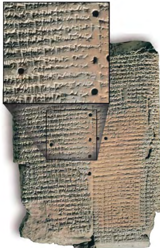
▲ The wedge-shaped symbols of cuneiform are visible on this clay tablet.

Sumerian artisans relied on new technology to make their tasks easier. Around 3500 B.C., they first used the potter's wheel to shape jugs, plates, and bowls. Sumerian metalworkers discovered that melting together certain amounts of copper and tin made bronze. After 2500 B.C., metalworkers in Sumer's cities turned out bronze spearheads by the thousands. The period called the Bronze Age refers to the time when people began using bronze, rather than copper and stone, to fashion tools and weapons. The Bronze Age started in Sumer around 3000 B.C., but the date varied in other parts of Asia and in Europe.